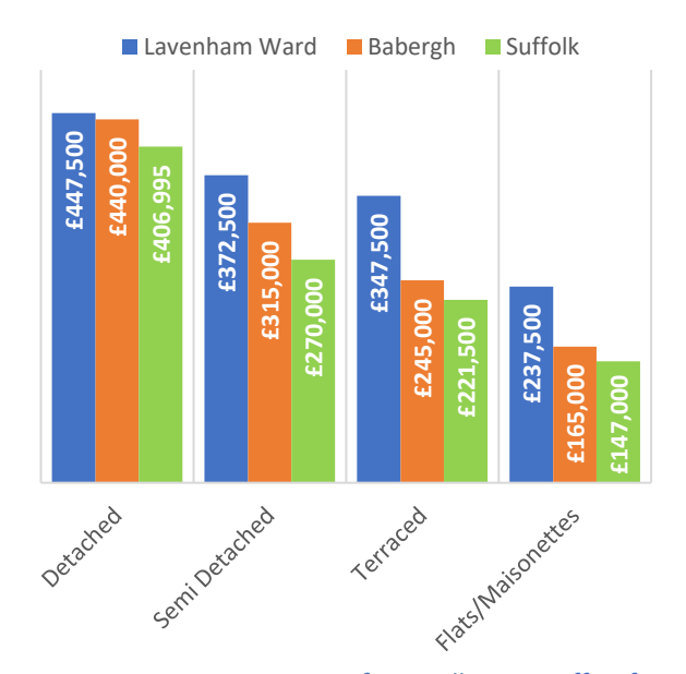
CHART 1.2: AVERAGE PRICES BY TYPE OF HOUSING, YEAR TO SEPT-22